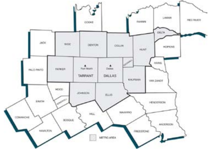
CW33 (KDAF-TV) Dallas/Fort Worth