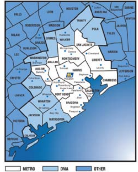
CBS 11 Houston